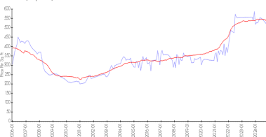
Symphony North vs Fort Lauderdale