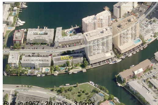
Built in 1967 - 29 units - 3 floors