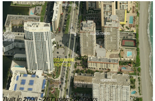
Built in 2008 ~ 267 units ~ 27 floors