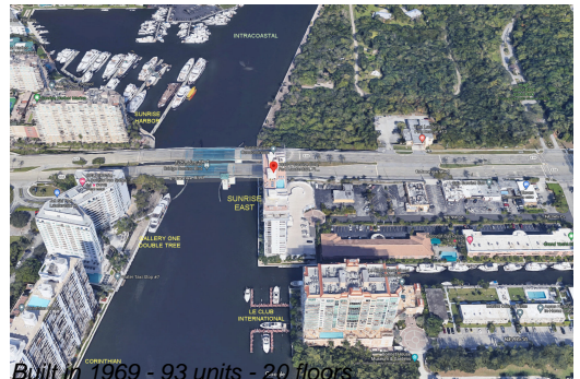
Built in 1969 - 93 units - 20 floors