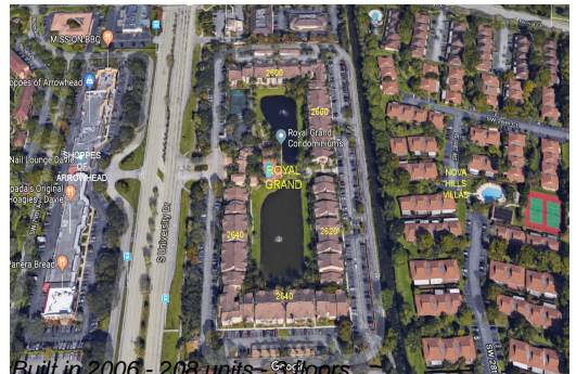
Built in 2006 - 208 units - 9 floors