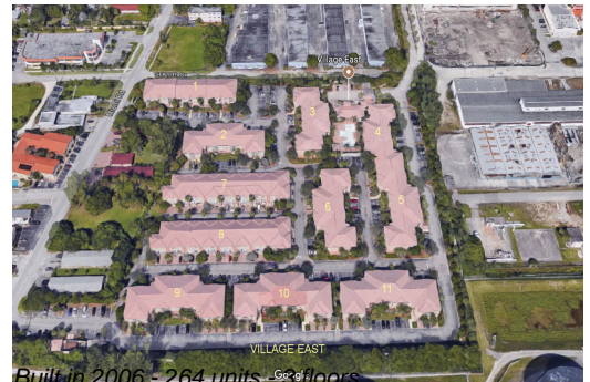
Built in 2006 - 264 units - 9 floors