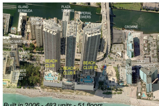
Built in 2006 - 483 units - 51 floors