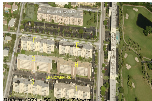
Built in 1971 - 56 units - 7 floors