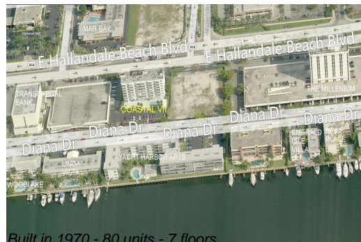
Built in 1970 - 80 units - 7 floors