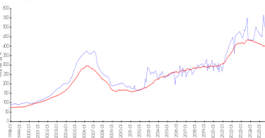
Aquarius vs Hollywood Beach