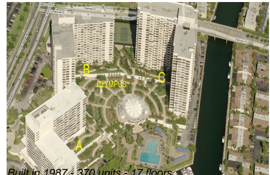
Built in 1987 - 370 units - 17 floors