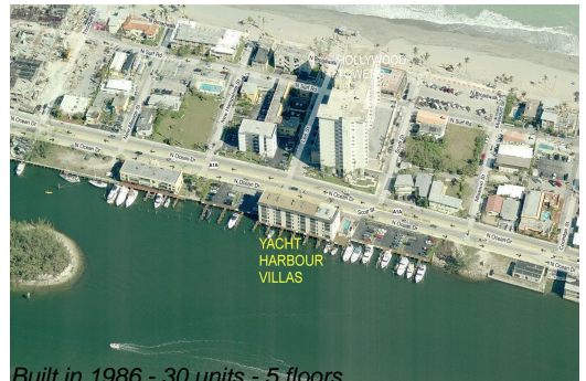
Built in 1986 - 30 units - 5 floors