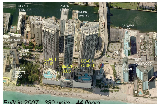
Built in 2007 - 389 units - 44 floors