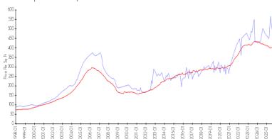
Aquarius vs Hollywood Beach