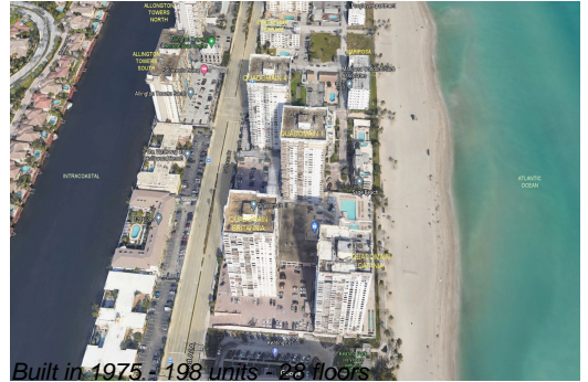
Built in 1975 - 198 units - 28 floors

The above valuated price is a baseline figure that does not take into account any specific renovation, upgrade, split, merge, or deterioration of the unit.