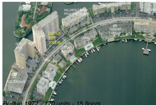
Built in 1972 - 170 units - 15 floors