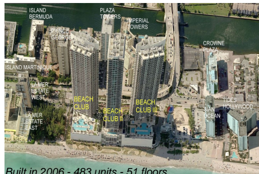
Built in 2006 - 483 units - 51 floors