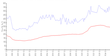
Ocean Marine Yacht Club vs Hallandale Beach