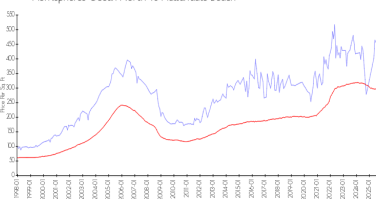
Hemispheres Ocean North vs Hallandale Beach