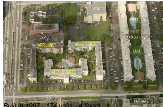
Built in 1967 - 174 units - 4 floors