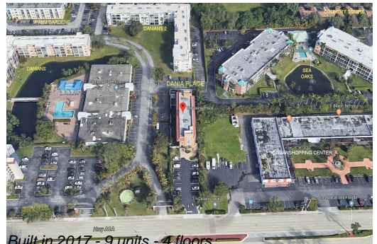
Built in 2017 - 9 units - 4 floors