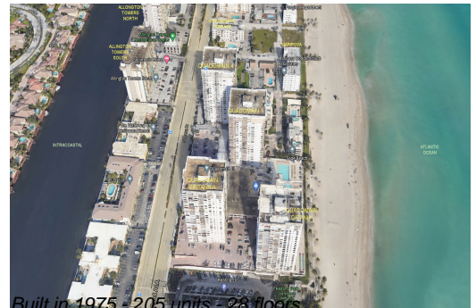
Built in 1975 - 205 units - 28 floors