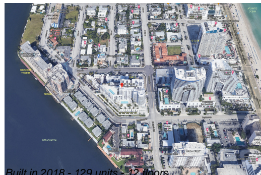
Built in 2018 - 129 units - 12 floors