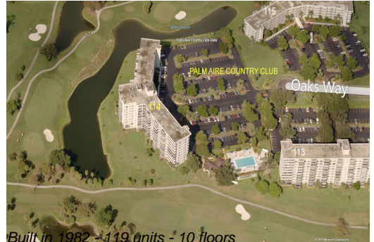
Built in 1982 - 119 units - 10 floors