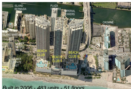
Built in 2006 - 483 units - 51 floors