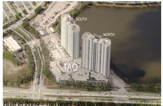
Built in 2009 - 198 units - 26 floors