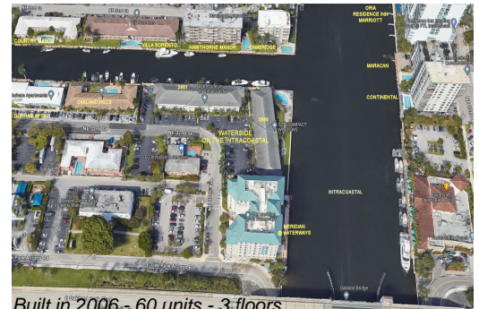
Built in 2006 - 60 units - 3-floors