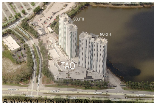
Built in 2009 - 198 units - 26 floors