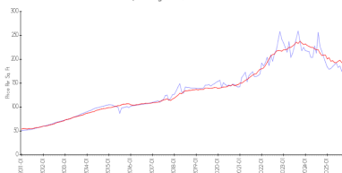
Ivanhoes West at Century Village (A-J) vs Pembroke Pines