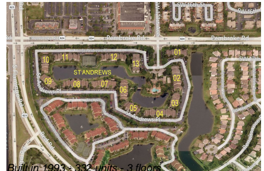
Built in 1993 - 332 units - 3 floors