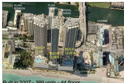
Built in 2007 - 389 units - 44 floors