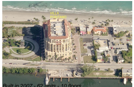
Built in 2007 - 62 units - 10 floors