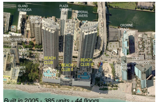
Built in 2005 - 385 units - 44 floors