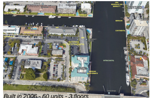
Built in 2006 - 60 units - 3-floors