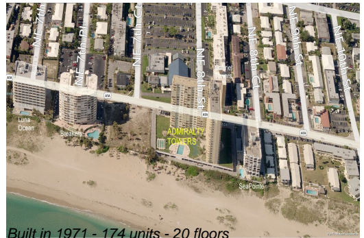
Built in 1971 - 174 units - 20 floors