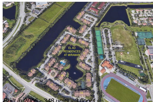
Built in 2006 - 348 units - 9 floors