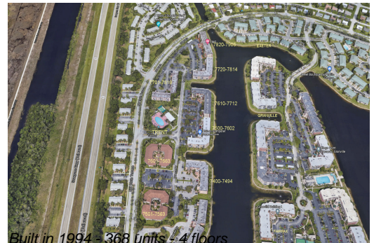
Built in 1994 - 368 units - 4 floors