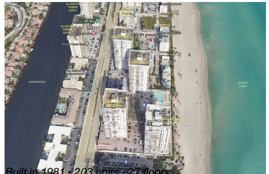
Built in 1981 - 203 units - 27 floors