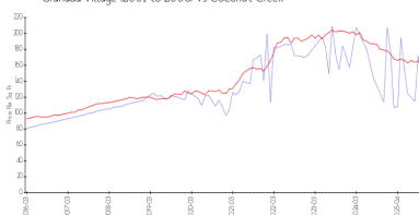
Granada Village (2001 to 2006) vs Coconut Creek