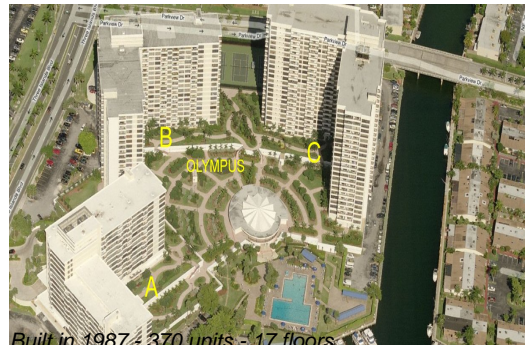
Built in 1987 - 370 units - 17 floors