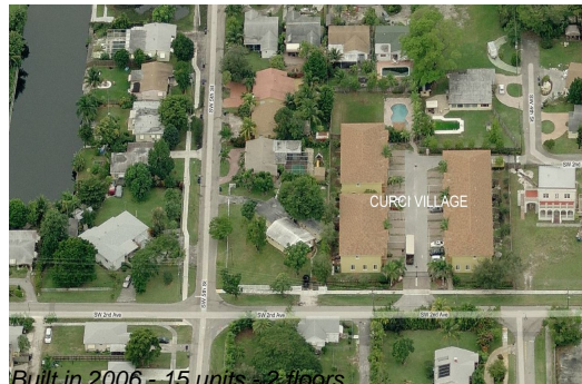
Built in 2006 - 15 units - 2 floors