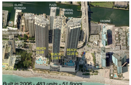
Built in 2006 - 483 units - 51 floors