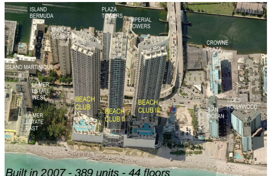
Built in 2007 - 389 units - 44 floors