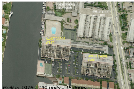
Built in 1975 - 139 units - 15 floors