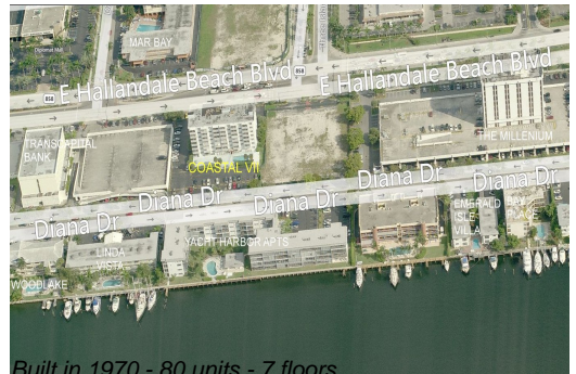
Built in 1970 - 80 units - 7 floors