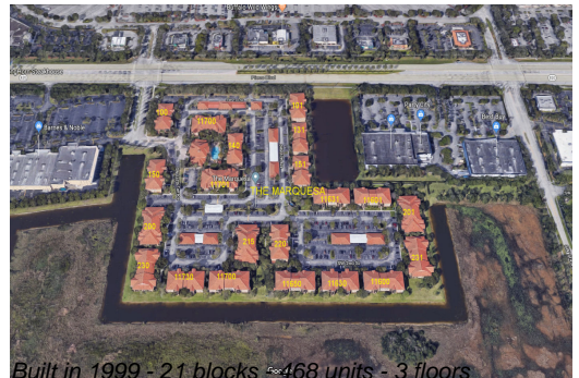
Built in 1999 - 21 blocks ~468 units - 3 floors