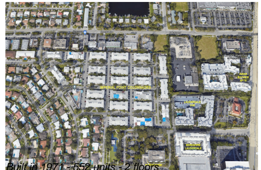
Built in 1971 - 552 units - 2 floors