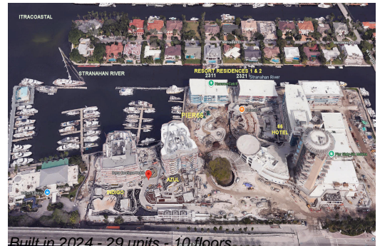
Built in 2024 - 29 units - 10 floors