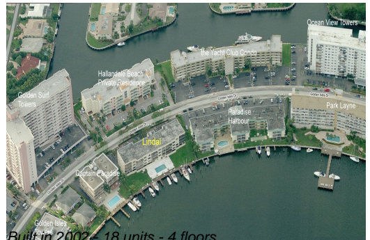
Built in 2002 - 18 units - 4 floors