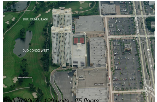
Built in 2007 - 199 units - 25 floors